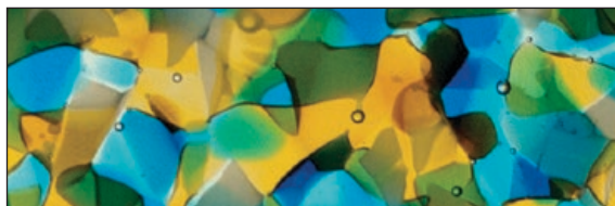
Closeup of the subtle but lovely reaction between Amber and Aqua Transparents