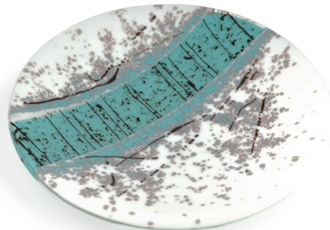
Plate by Patty Gray beautifully illustrates the reaction of Turquoise Frit on Red Reactive Opal